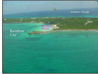
Rainbow Cay copy