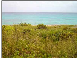
View from property