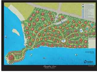
Page 1 of 1